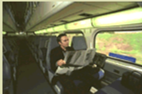
Carlink II will encourage travel on the Bay Area's Caltrain system