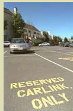
Preferential parking is a key benefit of new carsharing systems