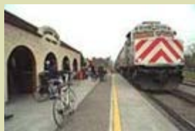
New mobility systems promote intermodal transportation

Transportation has transformed society over the centuries. From cross-country railroads, to electric and urban railroads, to the automobile, which now accounts for 95 percent of all person-miles of surface travel in the United States, each transportation system has left a mark on our past and present culture.