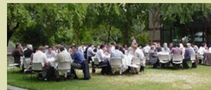
Workshop attendees enjoy informal discussions during lunch