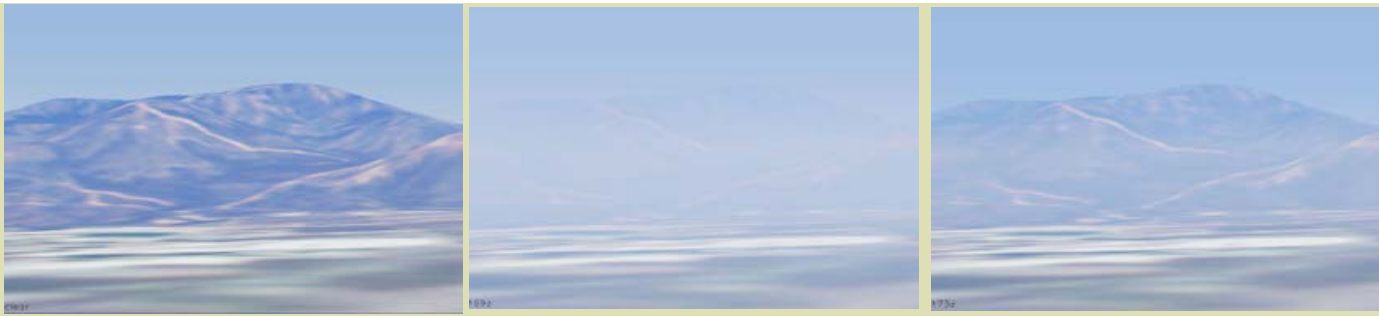
Simulated visibility results: San Gabriel mountains of the South Coast air quality basin (Los Angeles) from seven km for a clear day, polluted day, and polluted day with emissions controls

"The system has been very reliable and productive since we put it together in the fall of 1999," he says, adding that even though he has no formal computer science education, he learned how to construct such computer systems while doing his Ph.D. research in Environmental Engineering Science at the California Institute of Technology.