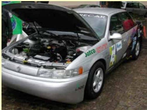
In addition to its Bibendum entry, Coulomb was the UC Davis entry for the 1998-99 FutureCar Challenge sponsored by U.S. DOE

The truck also integrates a Java-based telematics service framework with built-in graphical, voice, and web browser user interfaces that support additional consumer services such as video/audio-on-demand or intelligent traffic-aware vehicle navigation.