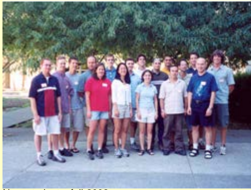
New students, fall 2002