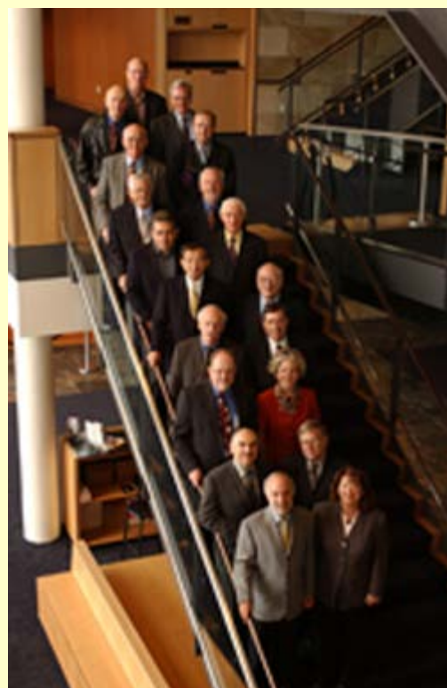
ITS-Davis Board of Advisors at the Mondavi Center