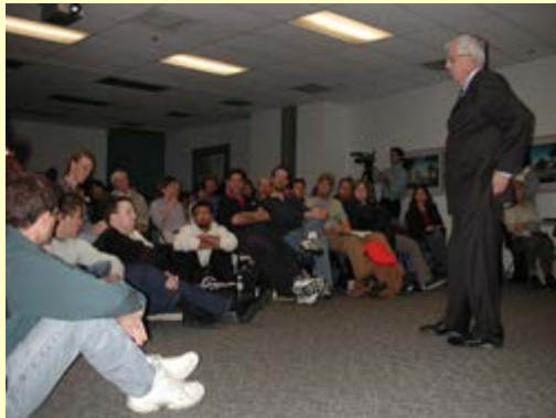
Sitting room only. About 100 people attended Dr. Ballard's talk