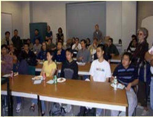
Students enjoy pizza at the inaugural meeting of the UC Davis student chapter of ITE

month, the chapter will elect a president.