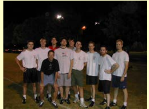
It's not all work; TTP students find time to play on a flag football team