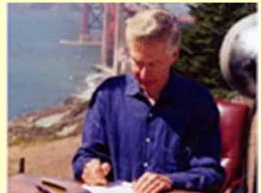
Gov. Gray Davis signs AB 1493 into law