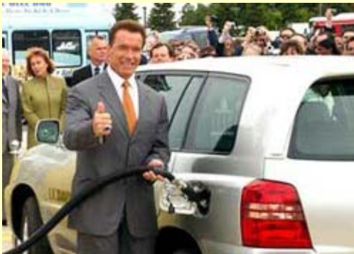
The governor gives thumbs-up to his fueling experience

After months of media buzz, California Gov. Arnold Schwarzenegger launched his long-anticipated Hydrogen Highway Network in an event at UC Davis — his first visit to a UC campus — on April 20.