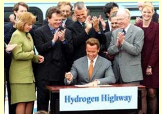
Signing the Hydrogen Highways Executive Order