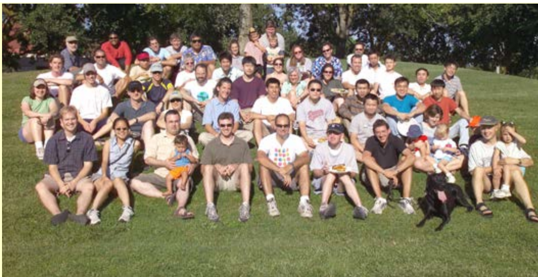
ITS-Davis friends and families gather to celebrate summer's arrival at the annual end-of-the-year picnic.

| ITS-Davis Home | Top | e-news archives |