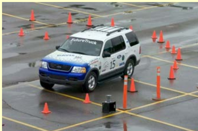
UC Davis 2004 FutureTruck entry on the course in Michigan

This is the fifth and final year of the FutureTruck (formerly FutureCar) Competition. Building on its success, U.S. Department of Energy and General Motors, with other government and industry sponsors, have launched a new competition series, Challenge X: Crossover to Sustainable Mobility. UC Davis is one of 17 universities selected through a competitive process to participate in the hands-on research and development program. As the Challenge X program gets underway in the coming months, ITS-Davis e-news will track UC Davis’s team and activities.