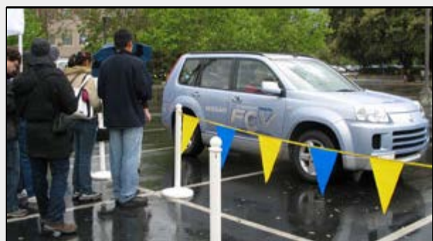
Lining up to ride in fuel cell vehicle

Despite steady rainfall, hundreds stopped by to test drive clean fuel vehicles and visit with Institute of Transportation Studies students, staff and faculty during the campus's annual open house in mid-April. Picnic Day