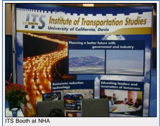
ITS Booth at NHA