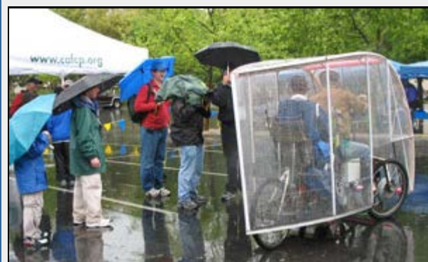
Student-designed Pedal-Electric Tricycle

Despite steady rainfall, hundreds stopped by to test drive clean fuel vehicles and visit with Institute of Transportation Studies students, staff and faculty during the campus's annual open house in mid-April. Picnic Day