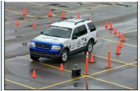
UC Davis FutureTruck PHEV