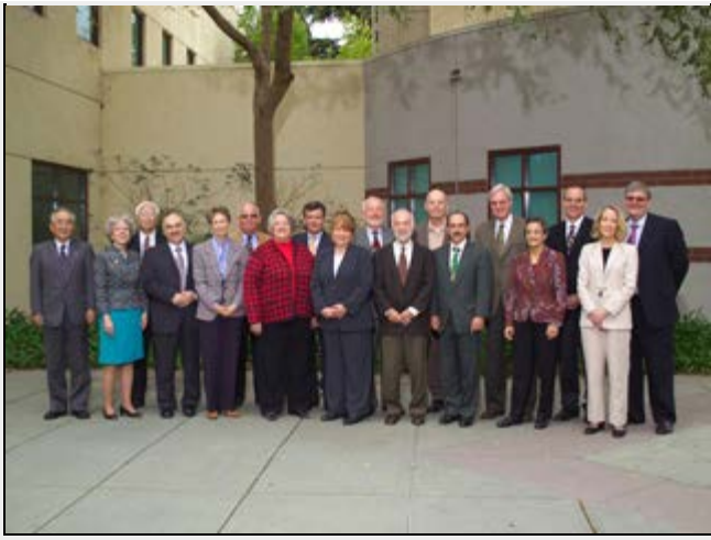
ITS-Davis Board of Advisors