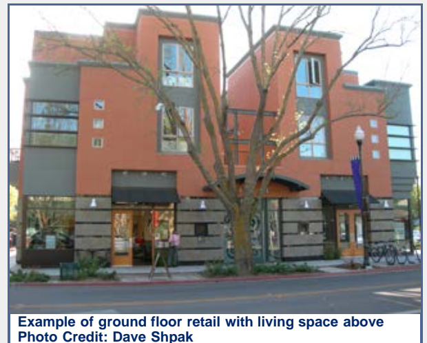
Example of ground floor retail with living space above