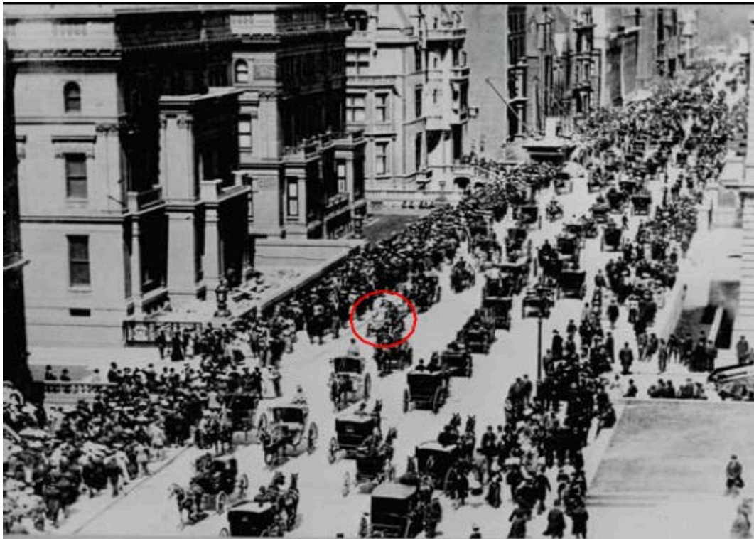
Easter morning 1900: 5 th Ave, New York City