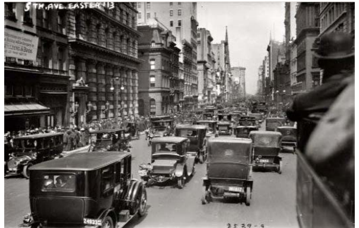
Easter morning 1913: 5 th Ave, New York City