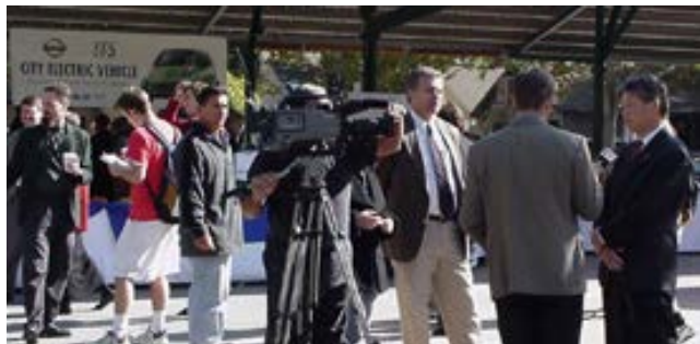
President Ishida being interviewed by one of four local TV network affilates that covered the event

These are the types of questions the new study should help answer.