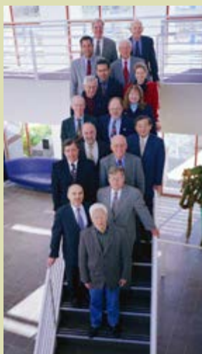
ITS-Davis Board of Advisors, December 2001