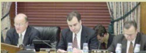
House Science Committee in session. Rep. Sherwood Boehlert, R-NY, presiding