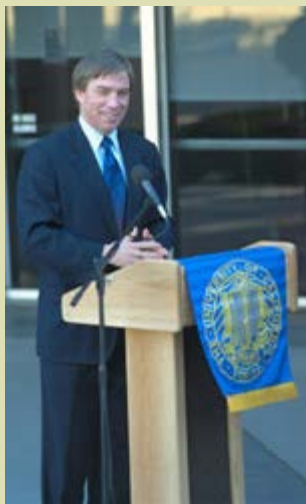
Rep. Doug Ose on a recent visit to UC Davis