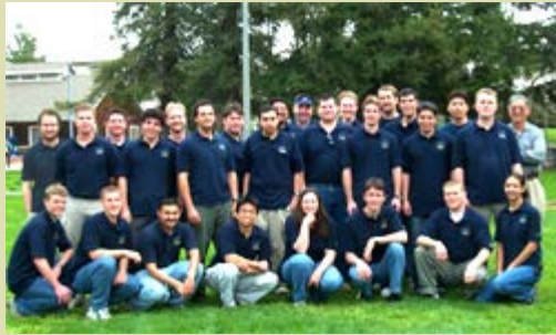
2002 FutureTruck Team