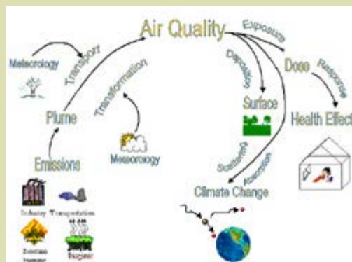
Air pollution lifecycle, as illustrated by Anthony Wexler