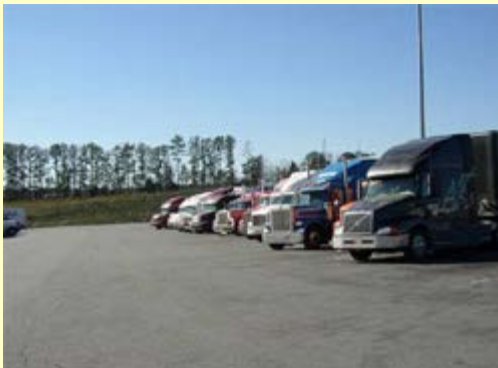
Trucks, mostly idling, at a truck stop in Cartersville, GA

The project, funded by Freightliner, LLC, and Sverdrup, is the first phase of a methanol fuel cell APU analysis. It is part of a larger series of U.S. Department of Energy-funded projects being conducted in cooperation with TIAX, that are assessing the technical and economic feasibility of using fuel cells as APUs. TravelCenters of America, a truck stop corporation owned by Freightliner, facilitated the research.