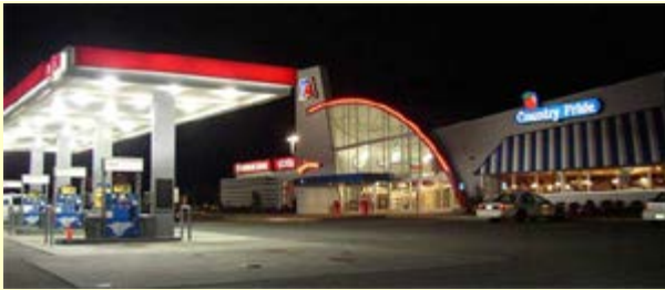
TravelCenters of America truck stop where surveying was conducted in Cartersville, GA