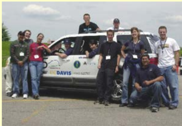
2003 UC Davis FutureTruck Team with "Yosemite."

A Ford Explorer sport utility vehicle rebuilt by UC Davis engineering students to run as a gas-electric "plug-in" hybrid has won second place in the national FutureTruck competition. The UC Davis team also won a prize for Best Dynamic Handling and the Cisco Systems award for telematics. The University of Wisconsin-Madison took first place overall.