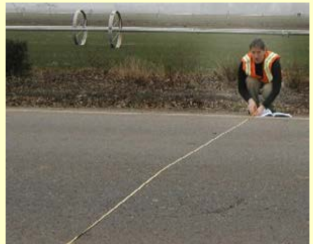
Sondra Rosenberg collects PM along a road in Davis.

Student Researcher Sondra Rosenberg sampled road dust at 11 sites in the Davis area. Among other findings, the pilot study found a large discrepancy between measured values and values predicted by current emissions tools, and a strong relationship to the adjacent land uses. This suggests the need for a more comprehensive evaluation to update current modeling methods.