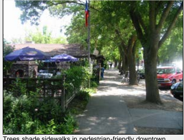
Trees shade sidewalks in pedestrian-friendly downtown Davis

counter sprawling patterns that now dominate new development in many metropolitan areas.