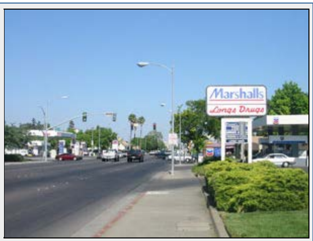
Sprawling pattern of retail development promotes vehicular traffic

However, the results also suggest that changes in neighborhood characteristics will have a greater impact on walking than on driving. Increased access, more alternatives to driving, improved safety, traffic calming, and enhanced sidewalk networks may all lead to more walking, researchers found.