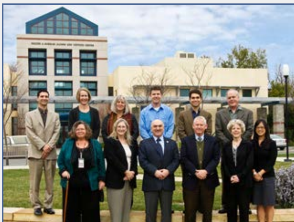
2009 STC External Advisory Council

The STC's External Advisory Council gathered on campus in February for its annual update and review of STC research and education activities. The discussion focused on innovative approaches to disseminating research results and filling educational needs.