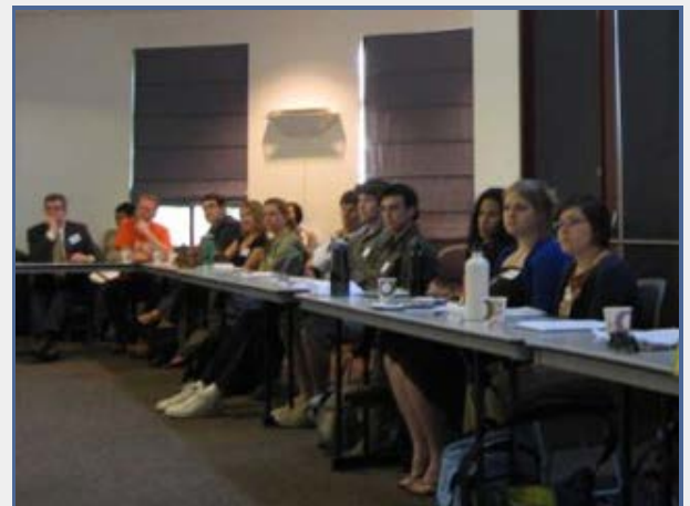
Audience hears about climate change career opportunities