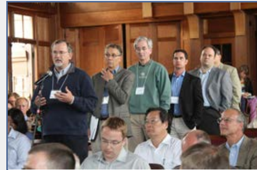
Attendees line up to comment during a session Q & A.

The Asilomar Conference brings together leading transportation, energy and policy thinkers in a casual, open and collegial setting that fosters discussion, debate and creative problem-solving. This year's theme, "Rethinking Energy and Climate Strategies for Transportation," recognized that political progress toward a secure, low-carbon transportation future is slowing, spurring the need and the opportunity to explore new strategies and government approaches.